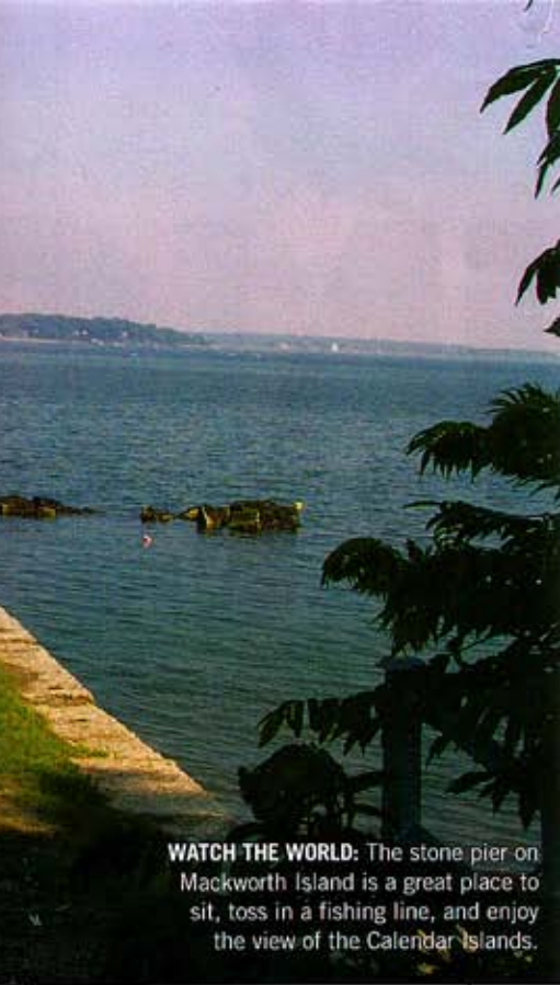
WATCH THE WORLD: The stone pier on Mackworth Island is a great place to sit, toss in a fishing line, and enjoy the view of the Calendar Islands.

and formidable, littered with broken oyster shells that crunch beneath tennis shoes, and covered in tidal silt thirsty enough to swallow a sandal from an unsuspecting foot. Hidden coves with sandy pocket beaches hide around corners, and waves, gentled by the bay, slap the sides of massive rocks carpeted with slippery seaweed and hungry snails.